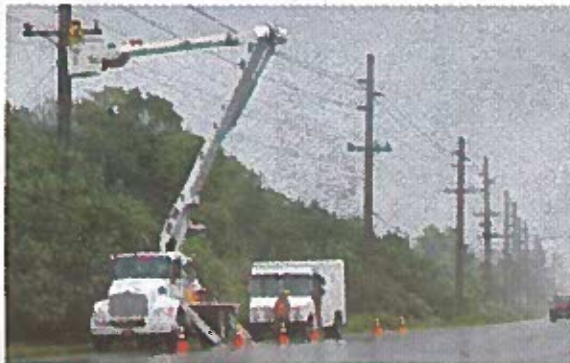
CAUTION: Despite the heavy downpour from Typhoon Mangkhut last month, Guam Power Authority crews work on power lines Sept. 13 along Route 1 in Dededo. GPA cautioned residents to stay away from downed lines and electrical sparks if they occur during or after Supertyphoon Yutu.

"Customers are asked to be patient. Crews will work as quickly as possible to restore service. Operations, including power generation at power plants,