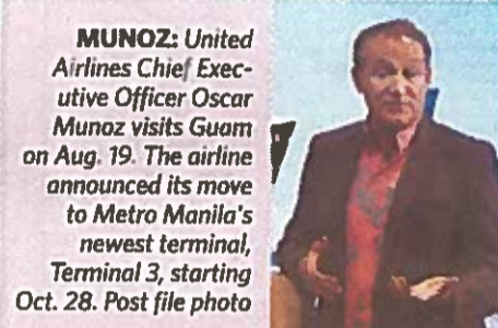
MUNOZ: United Airlines Chief Executive Officer Oscar Munoz visits Guam on Aug. 19. The airline announced its move to Metro Manila's newest terminal, Terminal 3, starting Oct. 28.